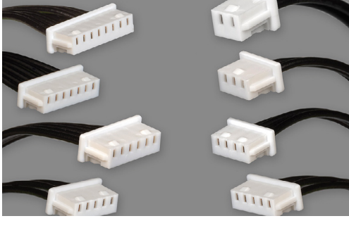
PicoBlade Standard Cable Assemblies

Point-to-point single-row configurations for PicoBlade designs immediately available Support both development and production programs