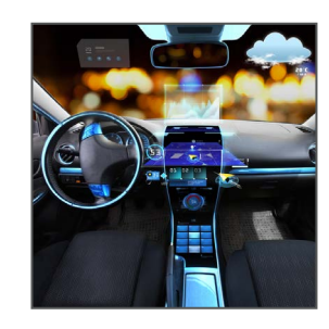
Top-Column Modules and Heads-Up Displays