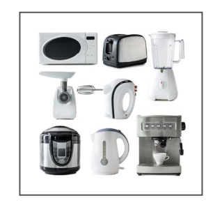
Small Household Appliances

We provide support throughout the product life cycle, including design, prototyping and production