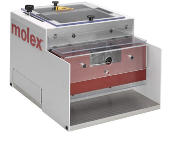
Pneumatic Stripping Machine for Large-Gauge Wires