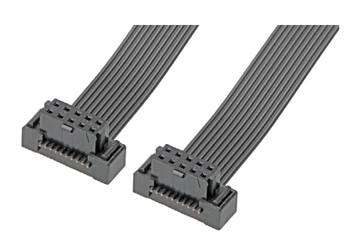
Milli-Grid Ribbon Cable Assembly