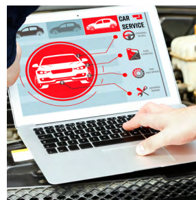
Mechanic Laptop Engine