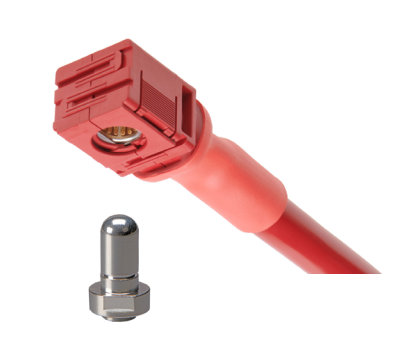
SW1 Cable Assembly and Locking Pin

SW1 Wire-to-Board/Wire-to-Busbar Interconnects incorporate COEUR socket technology which enables a high-current-carrying capacity in three sizes: 6.00mm (120.0A), 8.00mm (185.0A) and 11.00mm (300.0A) with a unique positive-locking design for secure mating.